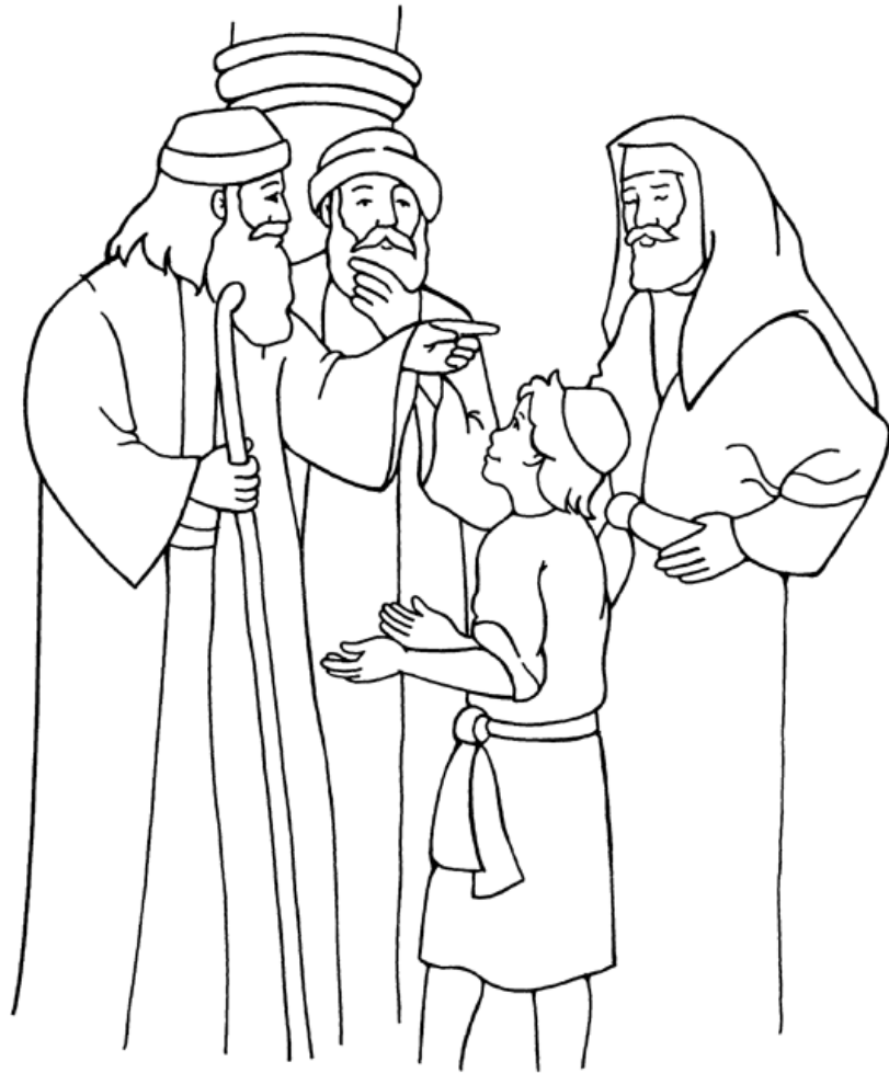
Jesus in the Temple Luke 2

From Thru-the-Bible Coloring Pages for Ages 4-8. © 1986, 1988 Standard Publishing. Used by permission. Reproducible Coloring Books may be purchased from Standard Publishing, www.standardpub.com .