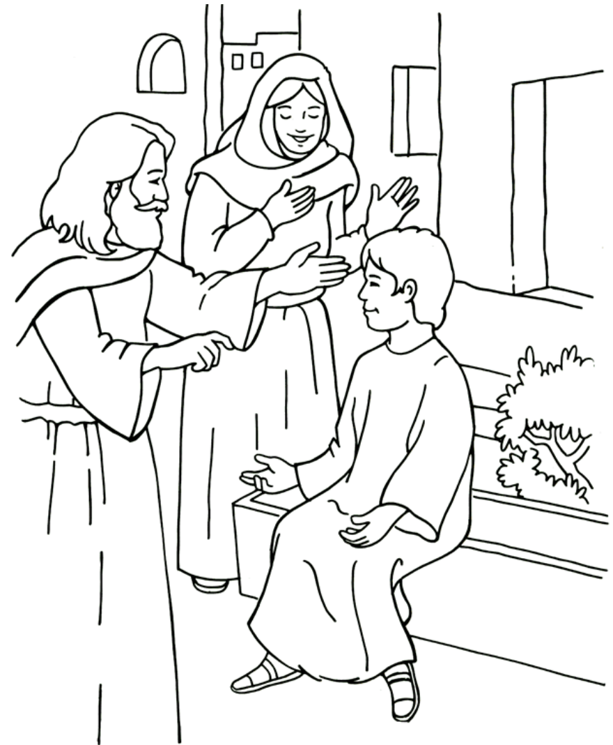
Jesus Raises a Young Man to Life