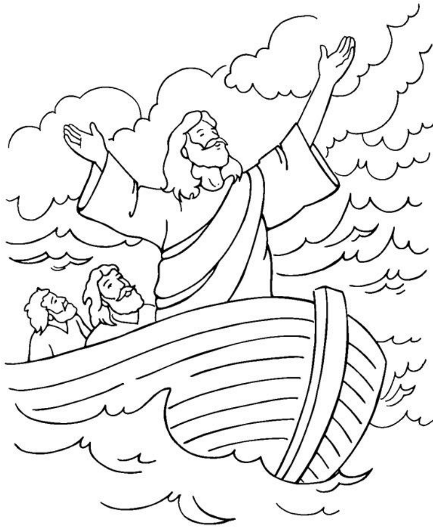
Jesus Calms the Storm

From Thru-the-Bible Coloring Pages © Standard Publishing. Used by permission. Coloring Books may be purchased from Standard Publishing, www.standardpub.com, 1-800-323-5473.