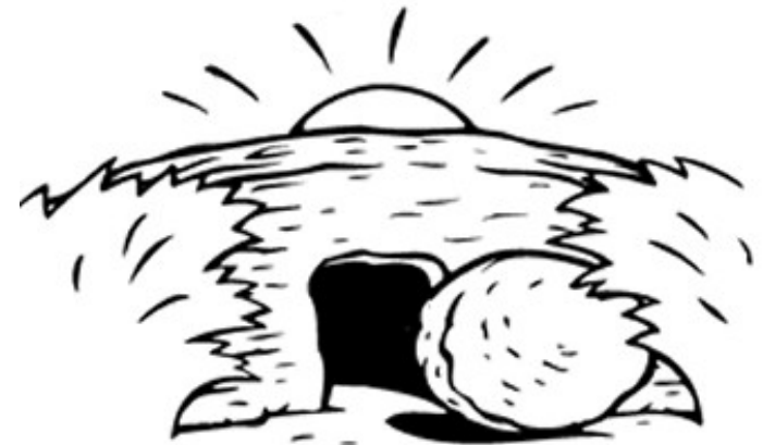
"He has risen! He is not here." Mark 16:6