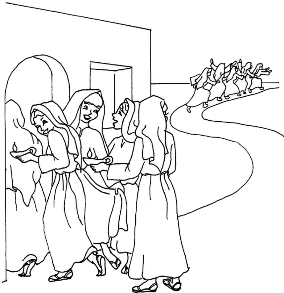
The Parable of the Ten Bridesmaids Matthew 25:1-13