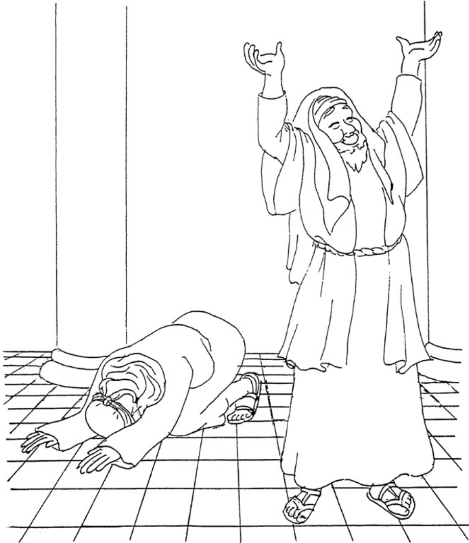
The Parable of the Pharisee and the Tax Collector